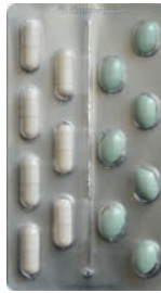
PILL + HARD BOVINE GELATINE, CELLULOSE (HPMC) OVAL PILL 700 mg, CAPSULE SIZE "0" 7 PILLS + 7 CAPSULES 126,5x70 mm