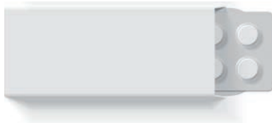
BLISTER + BOX