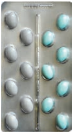
PILL + PILL (2 DIFFERENT COLORS) OVAL 700 MG 7+7 PILLS 126,5x70 mm