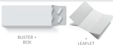
BLISTER + BOX

AVAILABLE POSSIBLE FORMS OF CONFECTION (YOUR OWN BRAND)