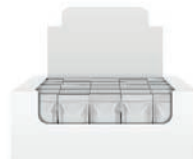
SACHETS + DISPLAY