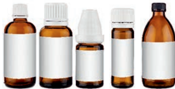
BOTTLE GLASS/ PET with CAP

AVAILABLE POSSIBLE FORMS OF CONFECTION (YOUR OWN BRAND)