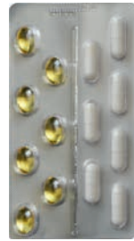
SOFT GELATINE CAPSULE + HARD BOVINE GELATINE, CELLULOSE (HPMC) 7 CAPSULES + 7 CAPSULES 126,5x70 mm

AVAILABLE POSSIBLE FORMS OF CONFECTION (YOUR OWN BRAND)