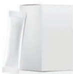
SACHETS + BOX

AVAILABLE POSSIBLE FORMS OF CONFECTION (YOUR OWN BRAND)